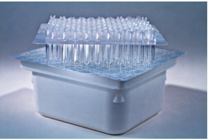
1 cc syringes, made from COP, "ready to fill".